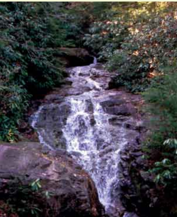
Lukes Falls near Rockport

In the 1970s, the Commonwealth of Pennsylvania began purchasing park lands and in 1980 the land was turned over to the Bureau of State Parks.