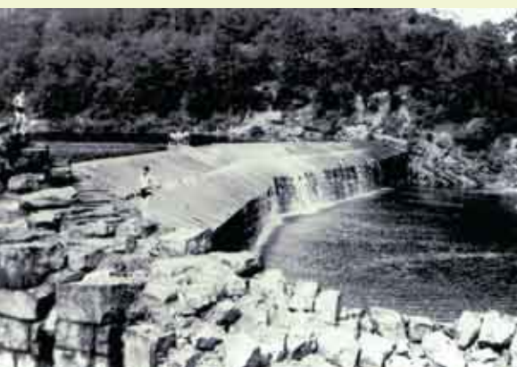
This is an historic photograph of the White Haven dam, which pooled up the water for the slack-water canal, and supplied water for the lock, which is the stone wall in the foreground.

A terrible forest fire swept through the Lehigh Gorge area in 1875, burning the remaining standing timber, many sawmills and stockpiles of lumber. The sawmills closed and the loggers departed.